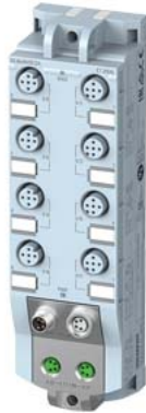
SIMATIC ET 200AL, DQ 8x 24 V DC/2 A, 8x M12, Degree of protection IP67