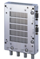
Video Input Module