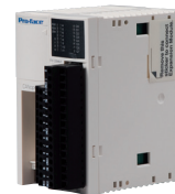
CANopen Slave Module

Cutout Compatible for: GP570, GP577R, GP2500, GP2600, GLC2500, GLC2600